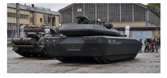
Fig. 4.A Russian stealth tank concept