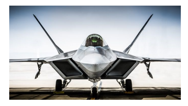
Fig. 3.A F22 Raptor with Stealth ability and the one of the 5th gen combat proven aircraft.

The stealth technology is used for reconnaissance, interception, attacking and bombing. Fig. 2 has shown the deflection of the waves. Some typical examples of stealth aircraft, ground vehicles and warships have been shown below