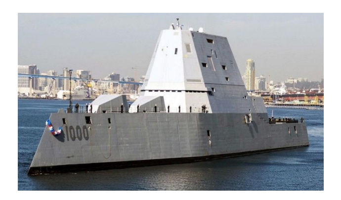
Fig. 5.A stealth US navy destroyer